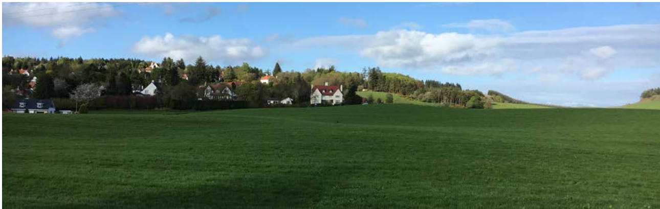
East of North Denniston Farm

In first considering North Denniston, this area can be split into two sections. North of the Farm is well defined and spatially contained by the edge of the Kilmacolm to the north-west and by the tree belt on the embankment of the former railway line to the east. The character comprises established rural fields of agricultural pasture-land meeting the well-defined edge of the settlement. The site is given a low sensitivity rating within the applicant's Landscape and Visual Impact Assessment (LVIA). East of the Farm is more visible and open in character, although contained by the low rolling topography. Gardens to properties on Gryffe Road that back on to the site are defined by mature vegetation and stone built walls. It is given a medium to low level of sensitivity within the applicant's LVIA.