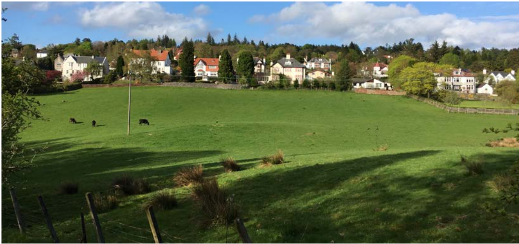
North of North Denniston Farm

In first considering North Denniston, this area can be split into two sections. North of the Farm is well defined and spatially contained by the edge of the Kilmacolm to the north-west and by the tree belt on the embankment of the former railway line to the east. The character comprises established rural fields of agricultural pasture-land meeting the well-defined edge of the settlement. The site is given a low sensitivity rating within the applicant's Landscape and Visual Impact Assessment (LVIA). East of the Farm is more visible and open in character, although contained by the low rolling topography. Gardens to properties on Gryffe Road that back on to the site are defined by mature vegetation and stone built walls. It is given a medium to low level of sensitivity within the applicant's LVIA.